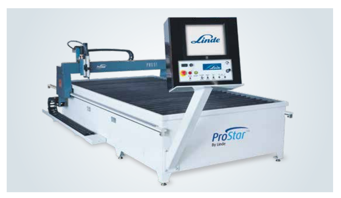
PROSTAR™ LANCER™ PRS51